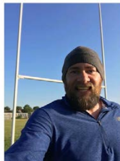
FRFC Team Black - as close as I'll get to 80 mins of rugby...