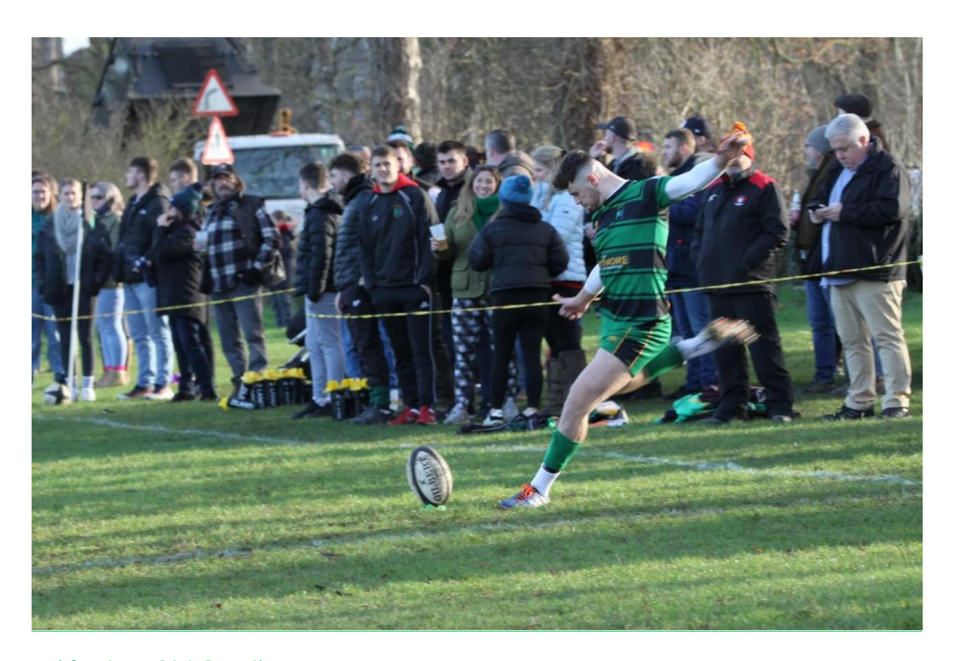
Fairford -v- Old Cryptians